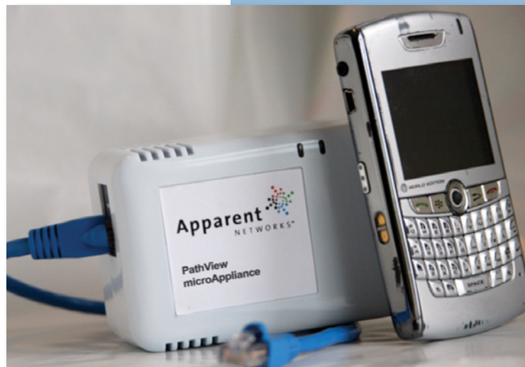
The PathView microAppliance is a compact, low cost and zero administration device that monitors and tests your end-to-end network.

Today's business services are increasingly dependent upon predictable network performance and availability. VoIP, disaster recover, software-as-a-service, virtual desktops and cloud-based applications all stress networks like never before. Your customers are adopting these new services and relying upon you to keep their networks running 24x7. The problem is that the very nature of your "break-fix" relationship makes it impossible to keep network issues from impacting your customers. So how do you move your customers to a managed service relationship that allows you to proactively assess and monitor their complex, distributed networks while increasing your profitability?